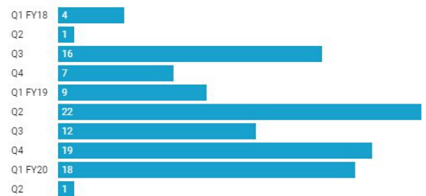
Cargo volume growth slowed sharply last quarter

% change in total cargo volume - year on year